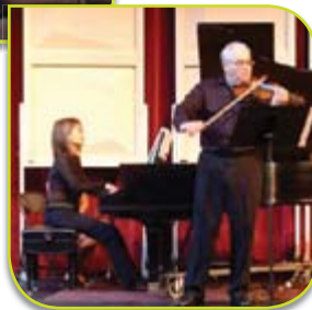
Chamber Music Alive

Through support from the James Irvine Foundation, the Community Foundation began funding strategic marketing grants to our local nonprofit arts organizations and monitored results by tracking changes in their audience attendance. In just one year, our program yielded a 13% increase in public, local arts participation. (Refer to placercf.org for a report highlighting these results.) We credit the work of our local arts council, PlacerArts and our nonprofit arts organizations to draw in new households using funds from our marketing grants. But we also know that by convening these groups to share ideas and work in collaboration, the outcome of the program increased exponentially.