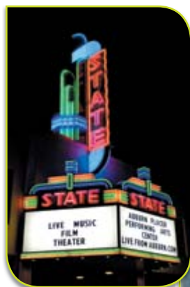
Auburn Placer Performing Arts Center

Our Donor Advised Fund holders give to many different causes in Placer County. The donor recommends grants from their fund and we handle all of the details—including ensuring the gift goes where it is intended and reporting back on the impact it made.