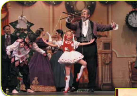
Placer Theater Ballet

The Community Foundation is committed to keeping the arts vibrant and accessible and plans to expand upon our grants to local arts, through the auspices and intent of our donors. This includes continuing our strategic Audience Development Program.