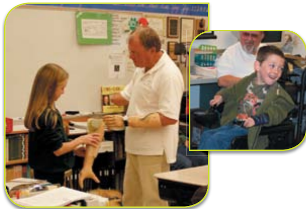
A Touch of Understanding

Through the annual Placer County Employee Giving Campaign contributions to the Community Foundation were pooled into a fund supporting our Technical Assistance Program (TAP) for local nonprofits. In 2009, the Placer County Employee Giving Fund helped organizations like A Touch of Understanding engage an outside consultant to address an aspect of their business model.