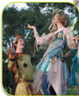
Take Note Troupe

The commitment of our arts donors, providers and volunteers to build permanent support for the arts do so because they value the cultural, educational and inspiring connections they bring to a community. Our collective efforts today will have great, lasting impact on future generations.