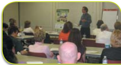
Town Hall meeting with local nonprofits

On the heels of these meetings, the Community Foundation's Board of Directors awarded technical assistance grants to twelve local nonprofits totaling $43,700. The type of assistance requested illustrates the focus and commitment nonprofits have to weather the economic climate. They include evaluating programs that are mission-specific in light of state and county budget cuts, fundraising strategies to garner new streams of revenue, creating business efficiencies, board development and strategic planning.