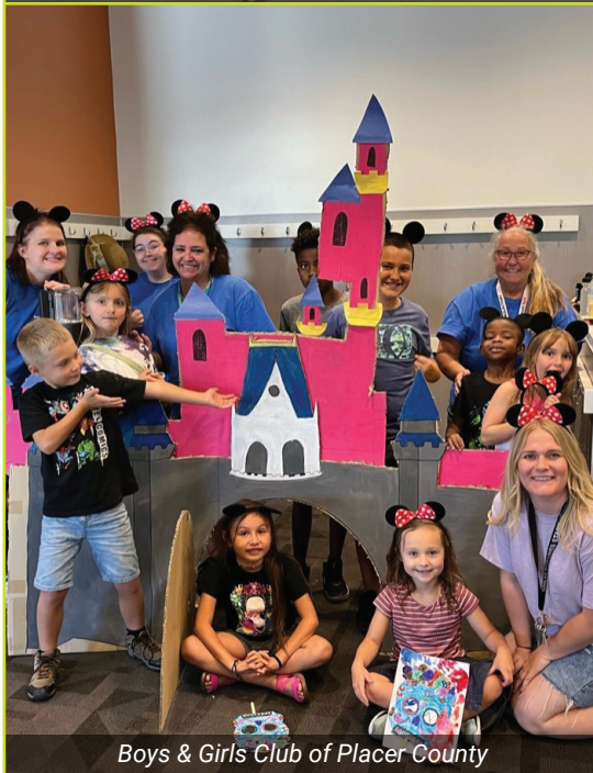
Boys & Girls Club of Placer County