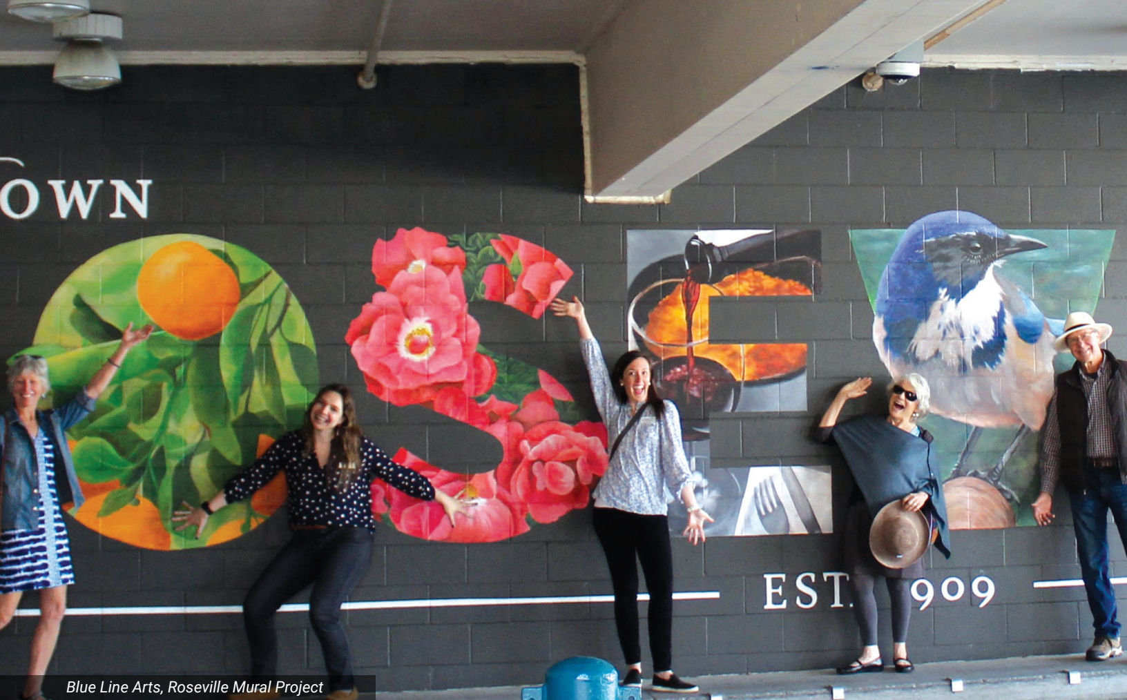
Blue Line Arts, Roseville Mural Project