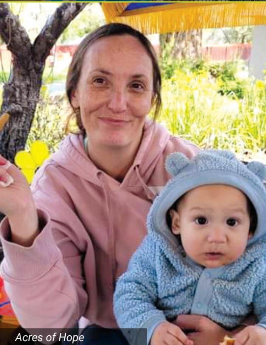
Acres of Hope