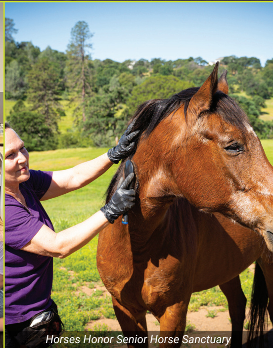
Horses Honor Senior Horse Sanctuary