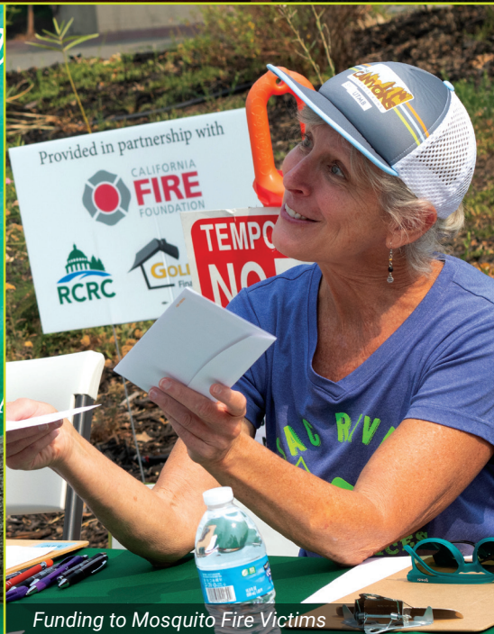
Funding to Mosquito Fire Victims