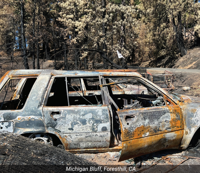
Michigan Bluff, Foresthill, CA