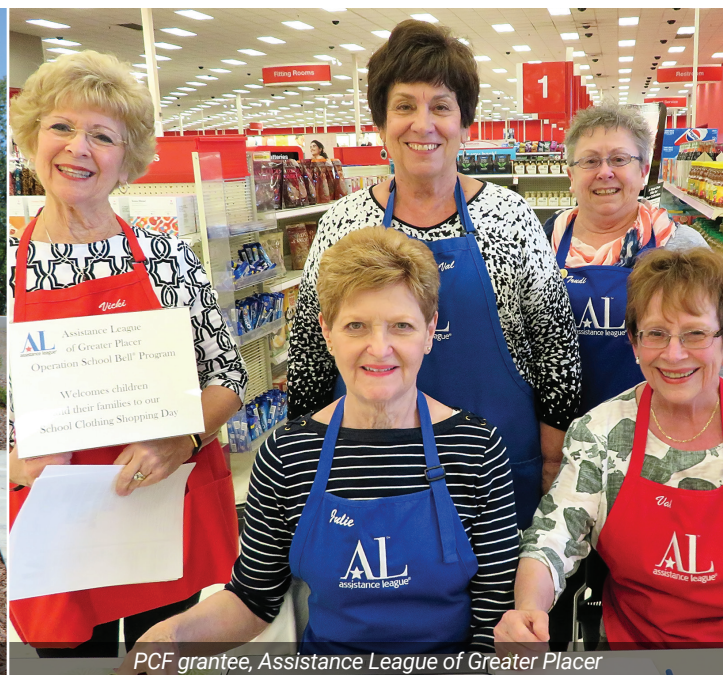
PCF grantee, Assistance League of Greater Placer