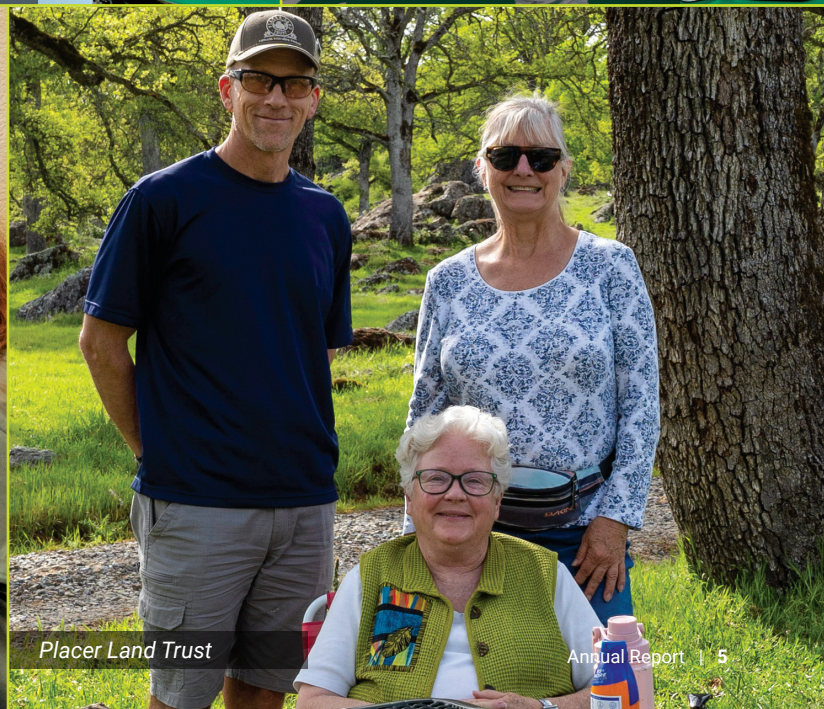
Placer Land Trust