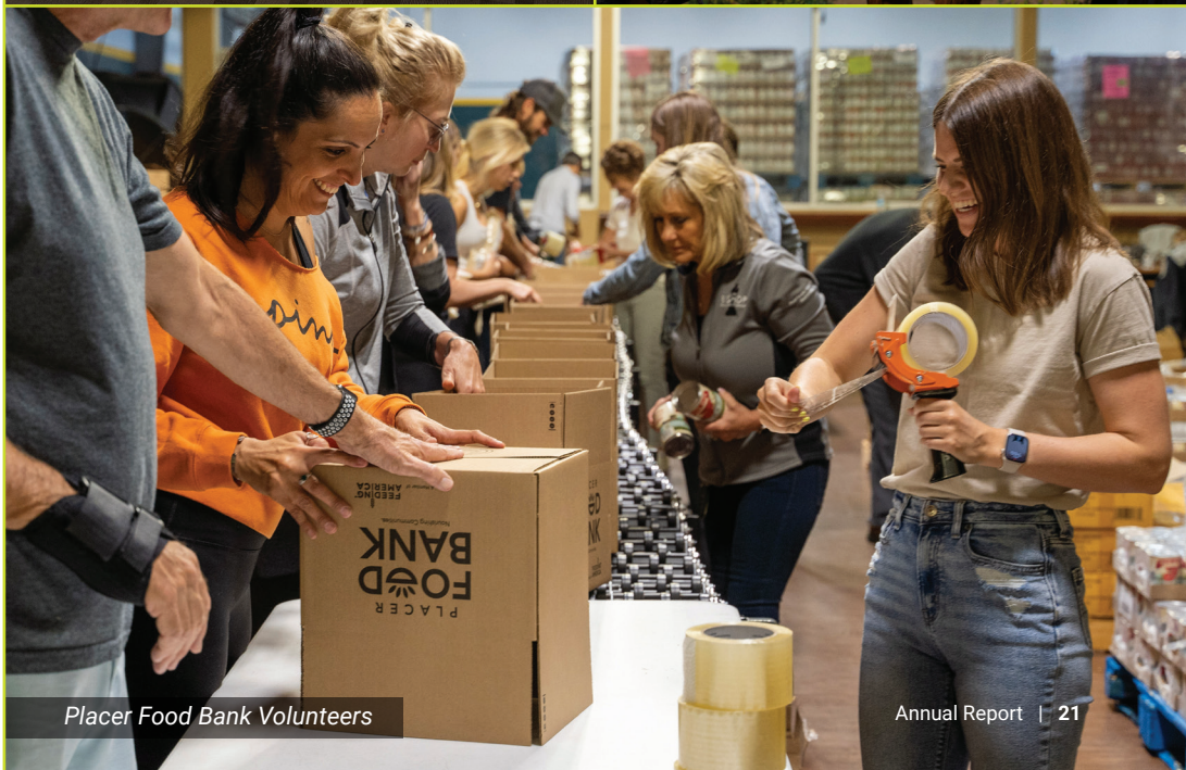
Placer Food Bank Volunteers