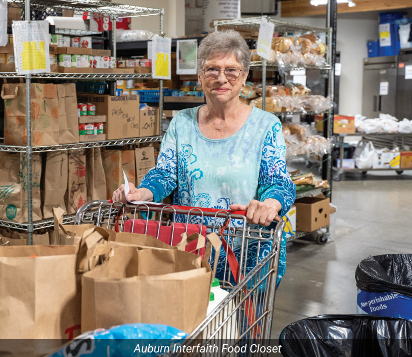
Auburn Interfaith Food Closet