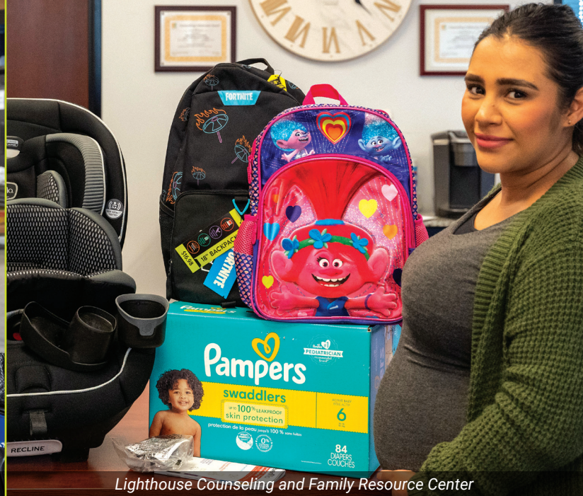
Lighthouse Counseling and Family Resource Center