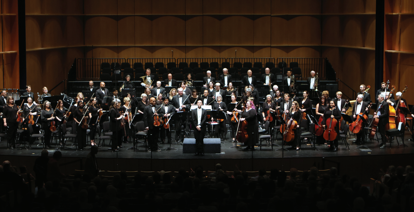
Auburn Symphony Orchestra performing at the Mondavi Center.