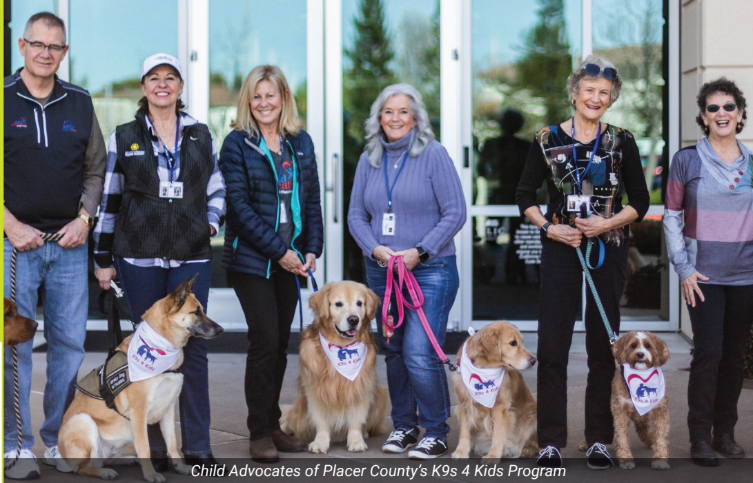
Child Advocates of Placer County's K9s 4 Kids Program