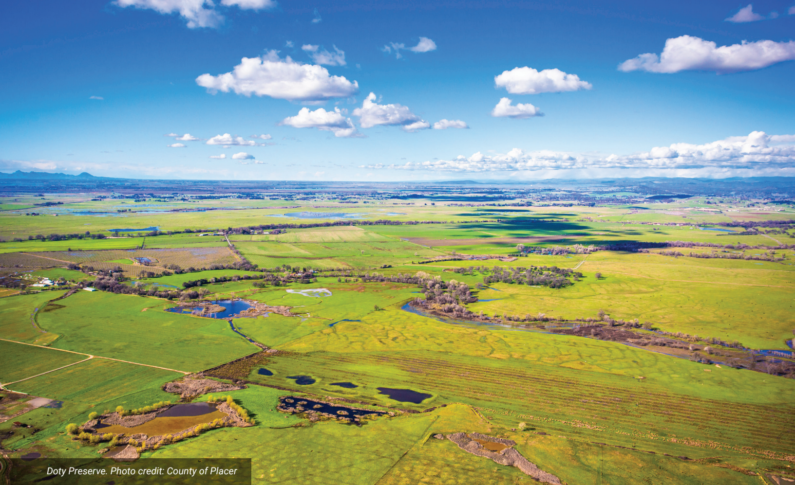
Doty Preserve. Photo credit: County of Placer