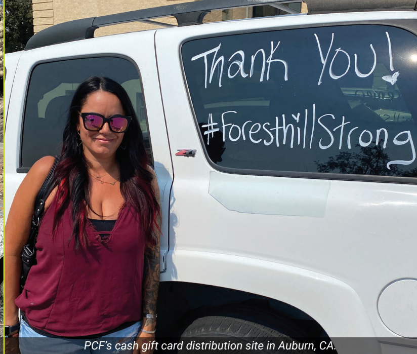
PCF's cash gift card distribution site in Auburn, CA.